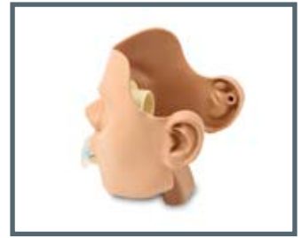
The Guedel Face Piece seen from the side