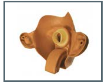
The Guedel Face Piece seen from the back